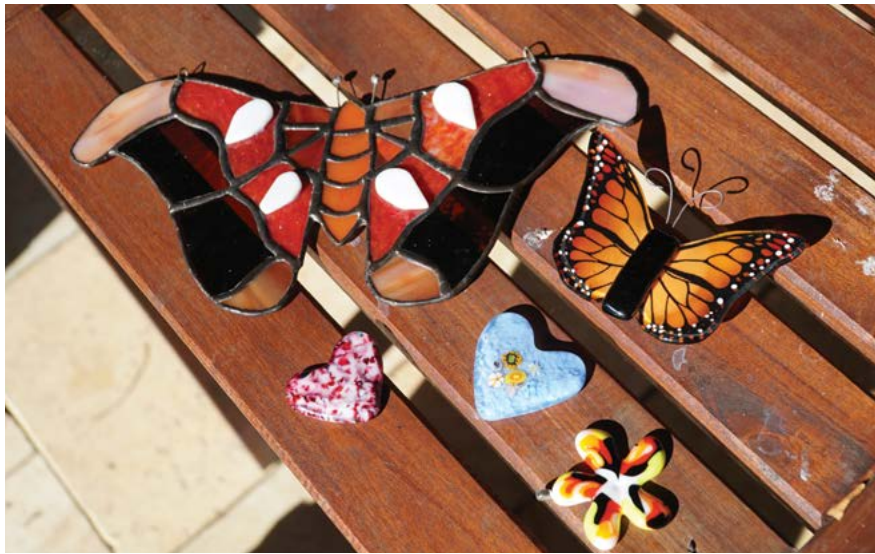
COURTESY OF RESHMA BHOOPAL Reshma Bhoopal’s stained-glass creations include colorful butterflies and hearts.

Last year, she explored a mushroom and gnome theme where she made mushroom plant stakes and