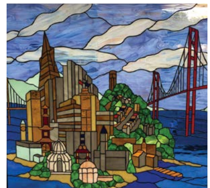
PHOTOS COURTESY OF RESHMA BHOOPAL Reshma Bhoopal's artwork includes "Pocket Hugs," top, and a scene of San Francisco, above.